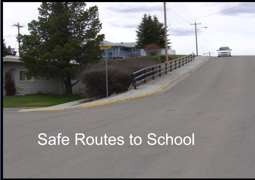
Safe Routes to School