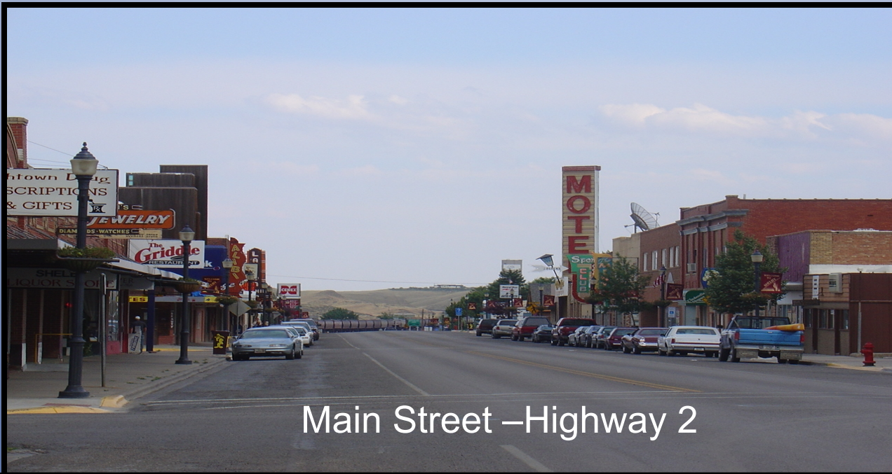
Main Street - Highway 2