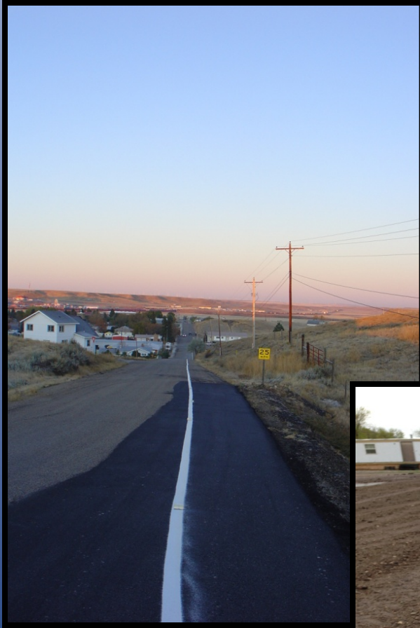
Coyote Hills Trail Loop