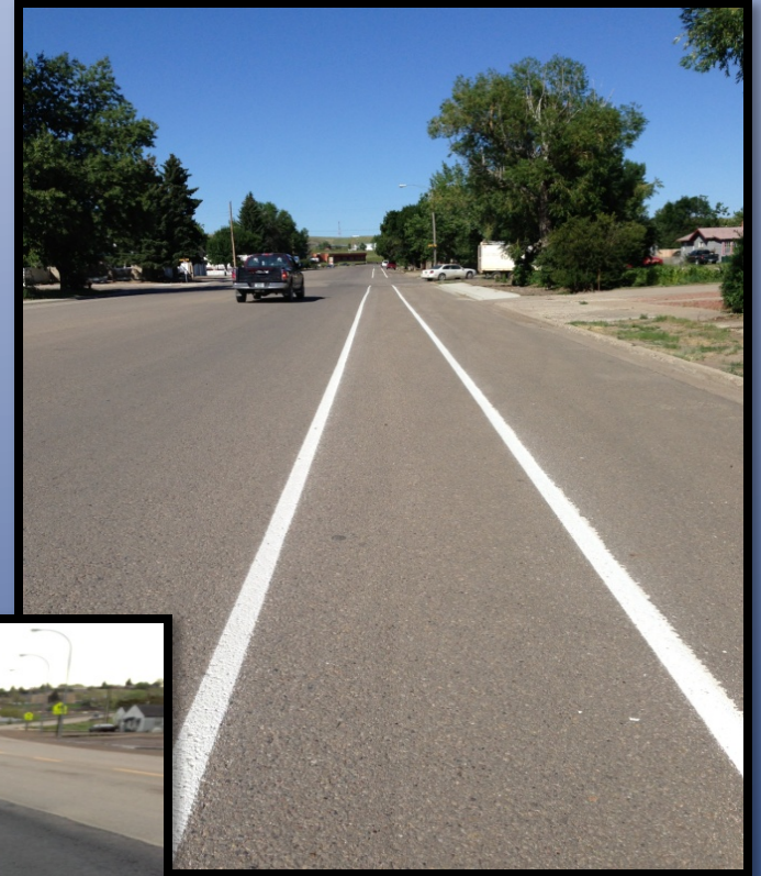
Galena Street Bike Path