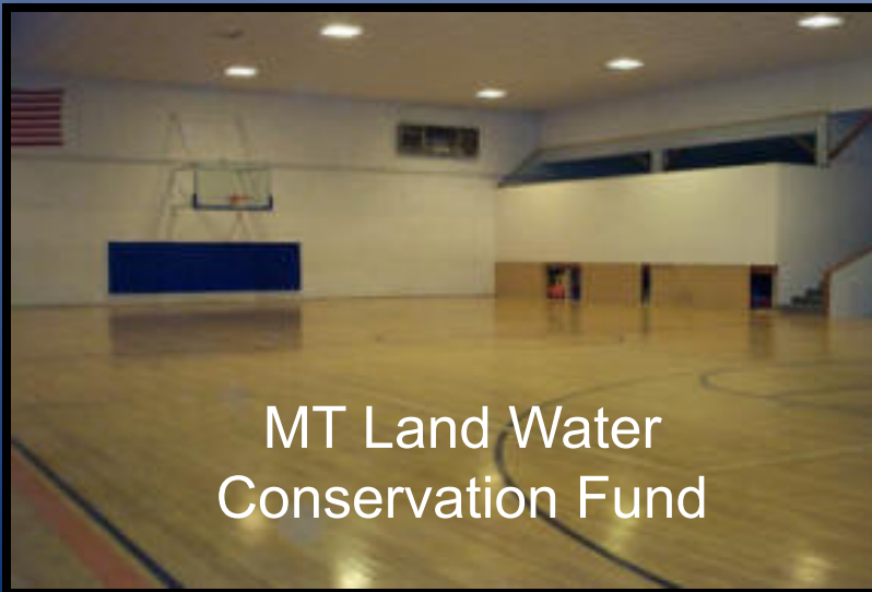
MT Land Water Conservation Fund