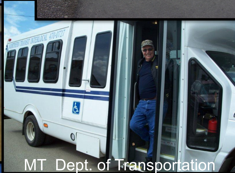
MT Dept. of Transportation