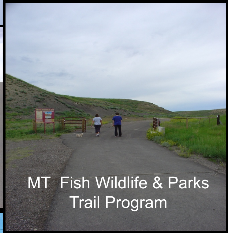
MT Fish Wildlife & Parks Trail Program